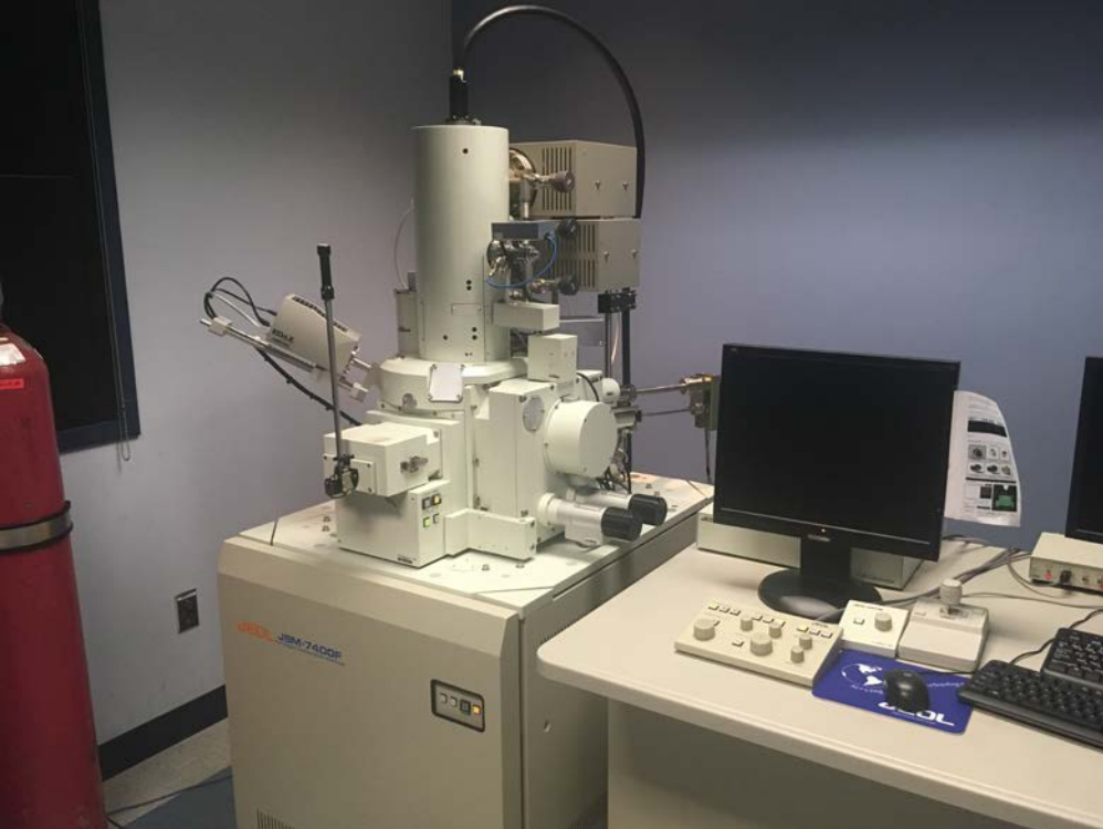
JEOL JSM-7400F SEM